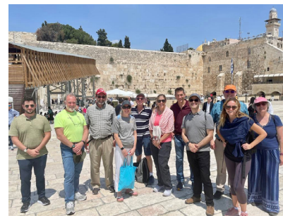
AIPLA's IP Practice in Israel visits the Western Wall during their fifth delegation trip.

The AIPPI-U.S., was originally founded as a non-profit organization in 1930 and has approximately 300 members. In October 2012, AIPLA acquired the AIPPI-US group. Membership in AIPPI-US automatically includes membership in AIPPI. The United States has one of the largest representations on the International Executive Committee of AIPPI. In 2022, both AIPLA and AIPPI celebrate 125 years of exceptional service to the IP community.