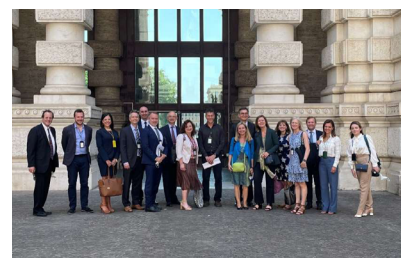
AIPLA's IP Practice in Europe hosted a 10-day trip visiting various countries.