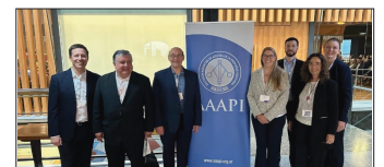
The IP Practice in Latin American Committee during their Delegation Trip.