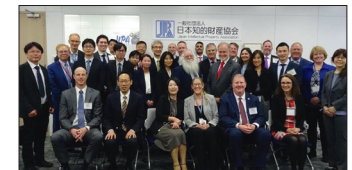
The IP Practice in Japan Committee pictured with JIPA.