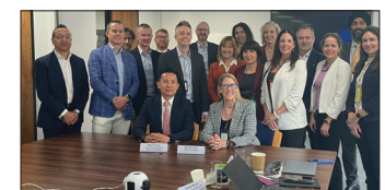
The IP Practice in Europe Committee during their Delegation Trip.