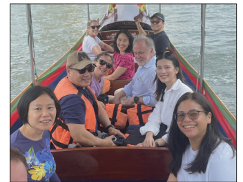
IP Practice in the Asia Pacific Committee members enjoy a river cruise in Bangkok.

The AIPPI-U.S. was originally founded as a non-profit organization in 1930 and has approximately 300 members. Membership in AIPPI-US automatically includes membership in AIPPI. The United States has one of the largest representations on the International Executive Committee - the principal decision-making body of AIPPI.